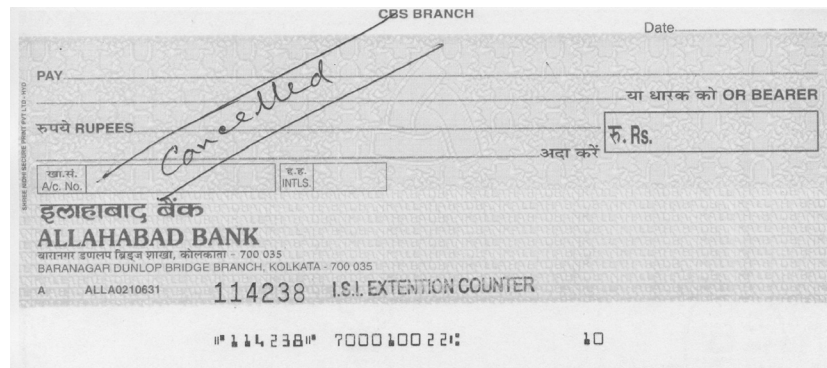
Figure 3. Counterfeit check created from the original check.

number of genuine-genuine and genuine-fake check pairs from a bank check image dataset.