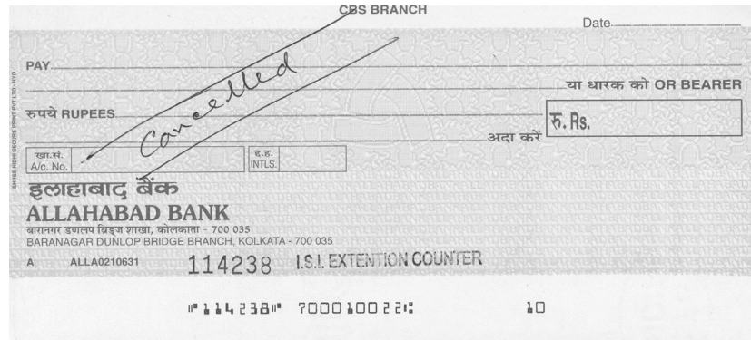
Figure 2. Original check.