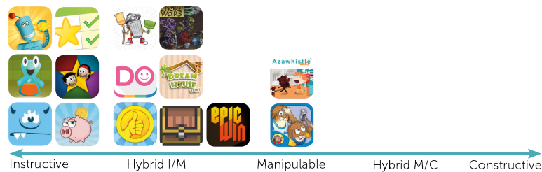
Figure 3: Apps positioned along axis of instructive, manipulable and constructive design

None of the apps were characterized as constructive, thus apps that are open-ended, focus on creative input/interaction and facilitate intrinsic motivation rather than using overt extrinsic rewards. These findings correspond to the findings of Goodwin and Highfield in their study on educational apps [34, 35].