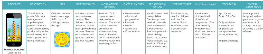
Figure 2: Excerpt from overall table