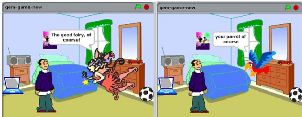
Fig. 2. Example of how students altered the game scenario in the scratch environment

the dialogue properly and according to their own preferences (e.g., see figure 2 next page).