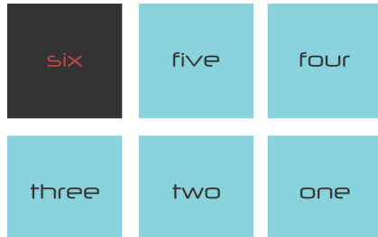
(b) The desktop layout