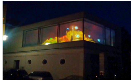
(b) The view on the facade