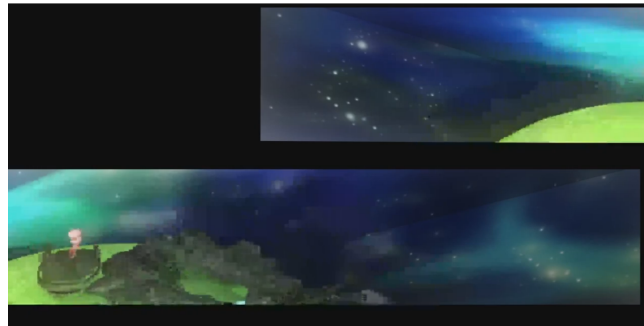
(a) The rendered image