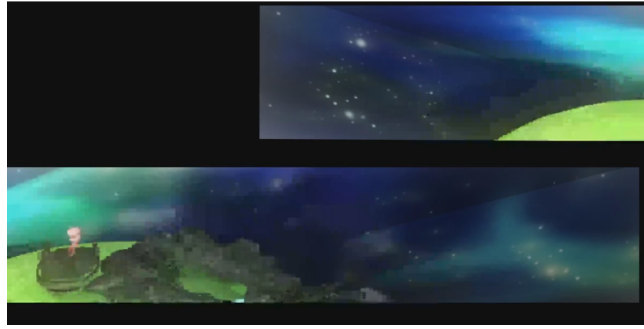
(a) The rendered image