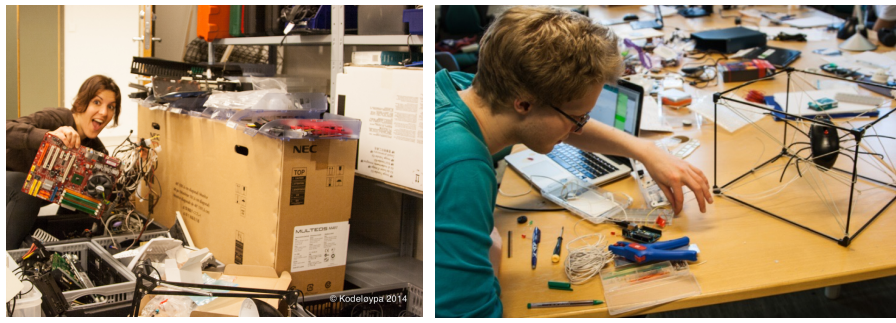
Fig. 1. Left: The artist organizes old computer pieces and other garbage to prepare the components to be used for the physical phase. Right: One of the assistant animates the spider installation by help of motors.

KODELØYPA is based on open source software and hardware and consisted of tutorials on open source tools, artifacts, creative sessions and students' demonstrations/presentations. Up to date, KODELØYPA has organized four workshops, allowing 63 students to be introduced to coding (about 15 children per workshop). Our thesis is that coding skills improve children understanding of the design and functionalities that underlie all aspects of interfaces, technologies, and systems we encounter daily. It is important that everyone should use code in some ways for expressive purposes to better communicate, interact with others, and build relationships.