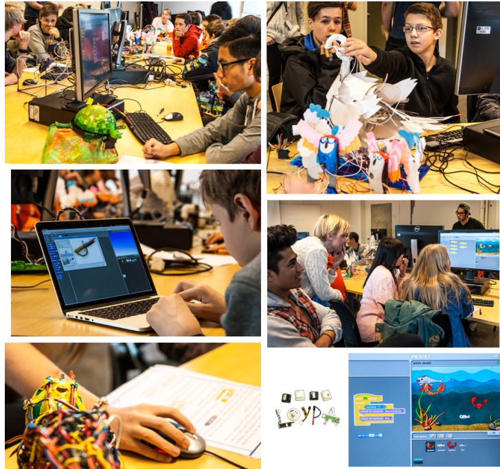
Fig. 3. Picture from one workshop: children play, program, interact with the assistants.