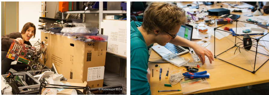
Fig. 1. Left: The artist organizes old computer pieces and other garbage to prepare the components to be used for the physical phase. Right: One of the assistant animates the spider installation by help of motors.

KODELØYPA is based on open source software and hardware and consisted of tutorials on open source tools, artifacts, creative sessions and students' demonstrations/presentations. Up to date, KODELØYPA has organized four workshops, allowing 63 students to be introduced to coding (about 15 children per workshop). Our thesis is that coding skills improve children understanding of the design and functionalities that underlie all aspects of interfaces, technologies, and systems we encounter daily. It is important that everyone should use code in some ways for expressive purposes to better communicate, interact with others, and build relationships.