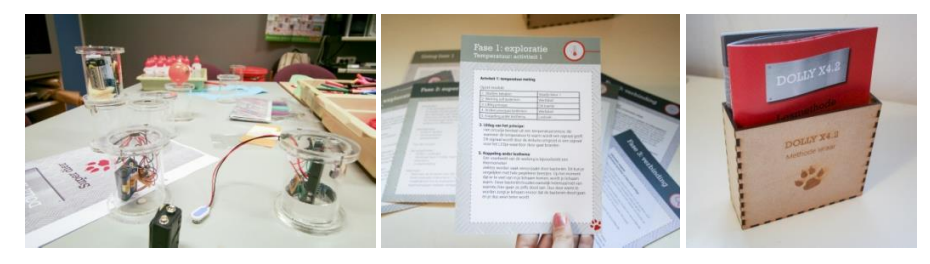
Fig. 4. DollyX4.2, the method and the user test setting.

The focus was on Dutch children (11-12) within their final years of primary school.