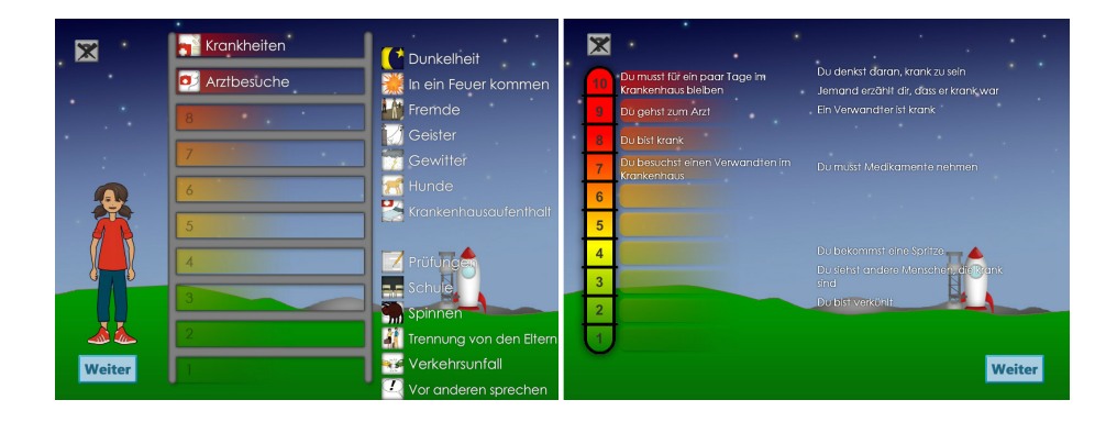
Fig. 1. Fear Ladder and Fear Thermometer

to exchange them for toys and items for their playroom. A further screen, the Statistics Display shows anxiety ratings for each individual level.