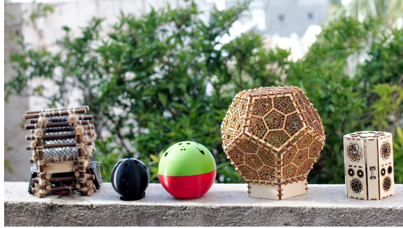
Figure 3: Various iterations were necessary in order to find a material which would be pleasing to hold (wood vs plastic), a structure that lets enough air flow toward the particles, and a shape which would create harmonious sound when the latter are fluttering (faces vs curves).