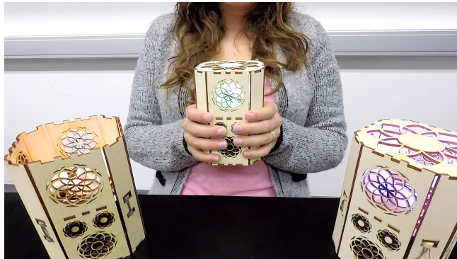
Figure 1: Dišimo: an ambient and shared biofeedback about heart rate variability.