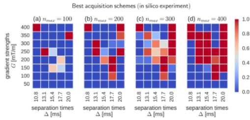
Figure 2: The averages of 10 best acquisition schemes found by SGA for the Watson's dispersed stick diffusion data (concentration parameter \kappa = 10 )

approach significantly outperforms the other two sub-sampling schemes (with p-value < 10^{-5} )