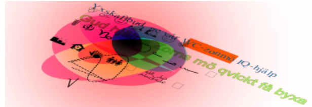
Figure 2: Example of a rendered picture following the canvas fingerprinting test instructions.

IQ-hjälp” and “Gud hjälpe Zorns mö qvickt få byxa”. They contain most of the letters found in the alphabet and we added special characters in them. For the first string, we force the browser to use one of its fallback fonts by asking for a font with a fake name. Depending on the OS and the fonts installed on the device, fallback fonts may differ from one user to another. For the second line, the browser is asked to use the Arial font that is common in many operating systems. Then, we ask for additional strings with symbols and emojis. All strings, with the addition of a rectangle are drawn with a specific rotation. A second set of elements is rendered with four mathematical functions: a sine, a cosine and two linear functions. These functions are plotted on a specific interval and using the PI value of the JavaScript Math library as a parameter. The third and final set of elements consists in drawing a set of ellipsis. These figures are drawn with different colors and with different levels of transparency. Since filters for opacity change among browsers, it creates differences between them. One of these ellipsis is overlapping the canvas element, and it is filled with a transparent radial gradient. Figure 2 displays an example of a canvas rendering following the instructions of our script.