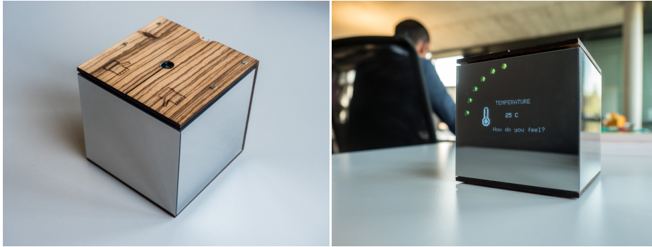
Fig. 2. ComfortBox is an interactive research tool designed to facilitate data collection in lab and in-situ comfort studies. The physical design is intended to help blend into the desktop setting and stay in the periphery of attention when not used.

runs on a MQTT server. This algorithm is tinkered by the experimenter and can work with input variables from the ComfortBoxes' sensor measurements, but also from other sensors used in the study. The buttons on top of the box allow for answering the posed questions.