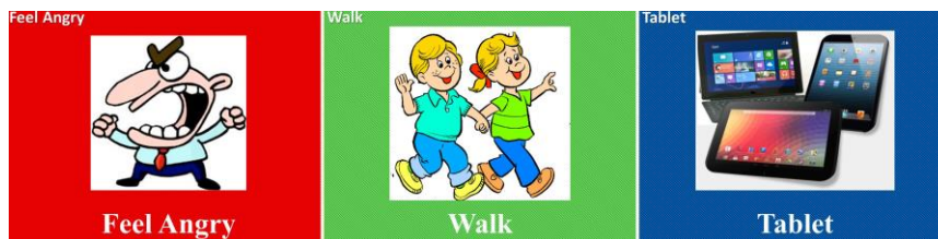
Fig. 2. Examples of the three types of design cards. From left: problem card, activity card, technology card.

ing, walking and listening to music with which the children can alleviate negative emotions. The technology cards have 37 popular digital devices like tablet, smartphone, and Google Glass.