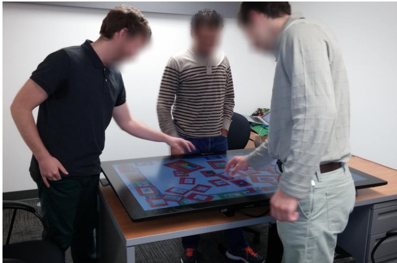
Fig. 1. Using the collaborative design tool on a Microsoft Perceptive Pixel system.

The card-based multi-touch supported design tool used in this study is a design application [12] running on the Microsoft Perceptive Pixel (see Figure 1). The Microsoft Perceptive Pixel is a 55-inch multi-touch display enabling simultaneous finger operations of different users like touching, pinching and dragging. The design application running on it consists of a blank working area in the center and design cards along each side (Figure 3). Each design card can be moved, rotated and resized by different designers simultaneously with the fingertips. A toolbox, located on each side of the table, provides a drawing tools and a commenting tool. Using a pencil tool, users can draw lines of different colors and thicknesses with the finger. An eraser tool and an undo tool are provided for correction. A commenting tool creates a textbox and a virtual keyboard for editing the typed comments. Each textbox can also be moved, rotated and resized.