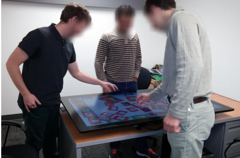
Fig. 1. Using the collaborative design tool on a Microsoft Perceptive Pixel system.

The card-based multi-touch supported design tool used in this study is a design application [12] running on the Microsoft Perceptive Pixel (see Figure 1). The Microsoft Perceptive Pixel is a 55-inch multi-touch display enabling simultaneous finger operations of different users like touching, pinching and dragging. The design application running on it consists of a blank working area in the center and design cards along each side (Figure 3). Each design card can be moved, rotated and resized by different designers simultaneously with the fingertips. A toolbox, located on each side of the table, provides a drawing tools and a commenting tool. Using a pencil tool, users can draw lines of different colors and thicknesses with the finger. An eraser tool and an undo tool are provided for correction. A commenting tool creates a textbox and a virtual keyboard for editing the typed comments. Each textbox can also be moved, rotated and resized.