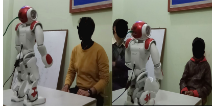
Fig. 1. Setup: A parent (left) and a child (right) interacting with NAO robot.

The set up of the study required using two portions. The first portion was for children and parents to engage with the NAO. We conducted our study in a quiet room, and as shown on the left side of Figure 1 below. The room was divided into two portions. On one side, the child and the parent independently interacted with NAO that had been placed on a table in front of the participant. On the other side, one of the researchers was controlling the speech recognition capabilities of NAO through a Wizard of Oz (WoZ) setup.