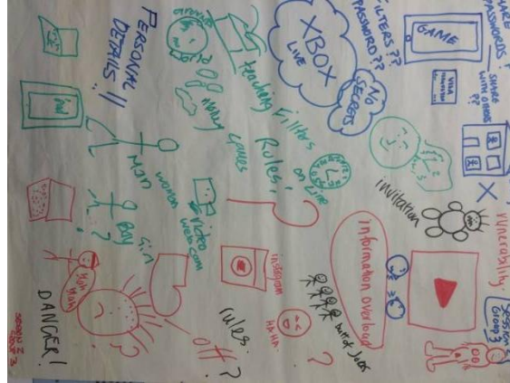
Fig. 1. Rich picture (size:32x23”) example from workshops.

In Stage 4 we brought all groups into a single room, and asked each group to gather beside their pictures, which the facilitators had pinned to the wall, and discuss what they drew and why. Each group did this in succession. This discussion was facilitator-led with carers encouraged to share stories and verbally enhance their picture drawings. The discussion was audio recorded and later transcribed.