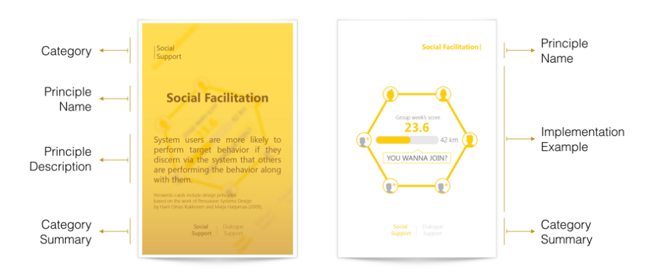
Fig. 1. A Perswedo Card from Social support category

This study aimed to design Perswedo cards as a domain specific carrier [18] bringing PT design principles into design processes. For this purpose, we firstly explored how to convert the knowledge from PSD into the information on the cards. Based on the literature review and the interview with eight design researchers, we designed Perswedo cards (Figure 1, available from goo.gl/H7JblW) with the following focuses: