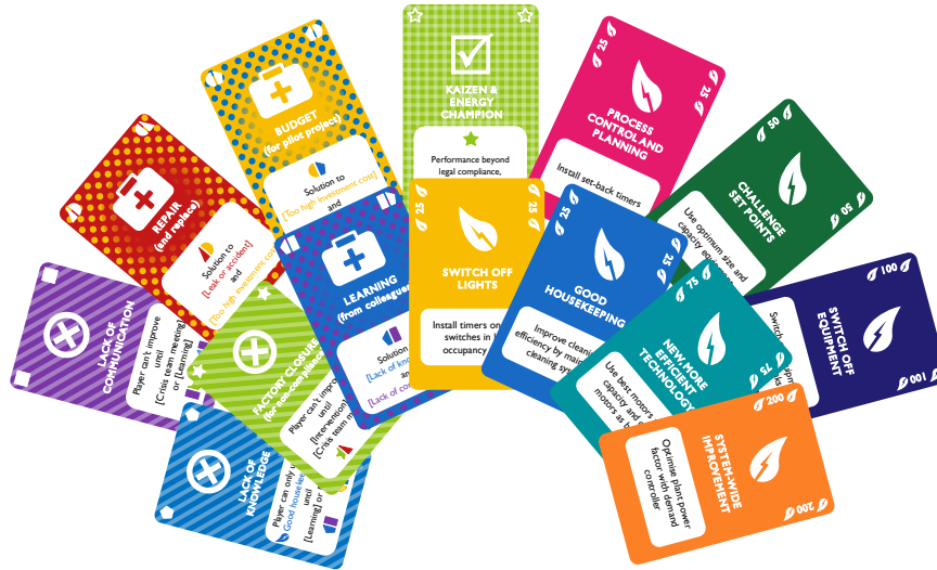
Fig. 2. Samples from the One thousand kWh card game

The card game consists of four categories of cards described in the next subsections.