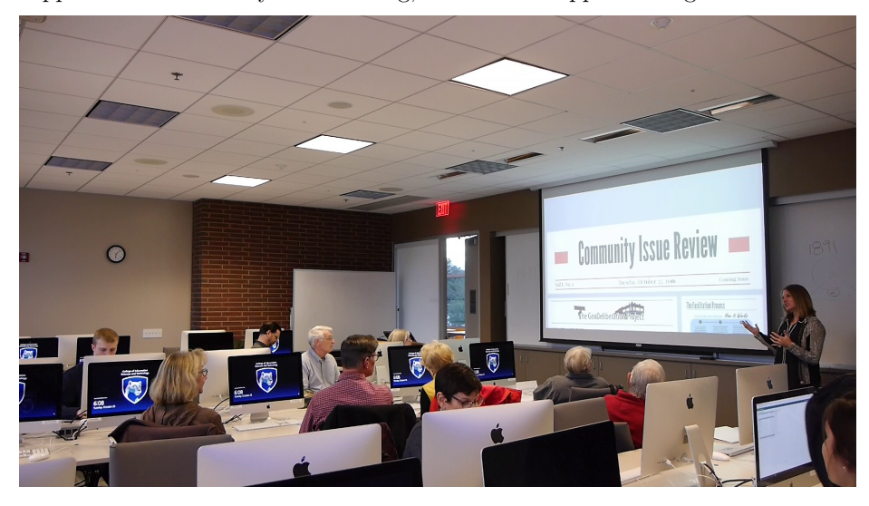
Fig. 3. Face-to-face meeting on Day 1

The community issue used in this study is inflationary tax indexing . The proposal is that real estate tax should be increased by at least inflation every year just to keep pace with the cost of providing services to the Borough . We recruited fourteen participants as the citizen panel. Most of them were recruited via mailings that were sent at random based on the addresses provided the borough office. Three of them from specific student organizations were recruited via targeted email. The three students rent in the borough. The rest are homeowners. There are also four subject matter experts involved. Two of them are proponents that support the inflationary tax indexing, and two are opponents against the issue.