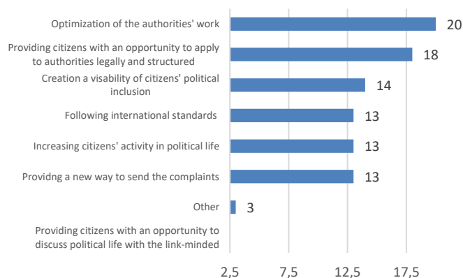
Fig. 1. Expert's answers to question "What is the purpose of e-participation tools development in Russia?", %

The experts were asked to detect the purpose of e-participation tools' development in Russia. This question supposed to show not the experts' knowledge in the regulations but their personal opinions and feelings about the current situation. It's interesting to note, that 1/5 part of experts underlined the optimization of the administrative process, focusing more on civil servants' side than on citizens (fig.1). It also should be noted that the 3rd most popular answer touched the ostentatious nature of this phenomenon in Russia: the experts supposed that some of the actions in the field of opening governments and involving citizens' in the political process just seemed to act like real e-participation tools. However, these tools don't work well in real life. Some of the experts also made an accent on the fact that institutions of direct democracy (treatment, civil initiatives) are still more popular in Russia. In this way, the developing tools repeat the political landscape of the state very much.