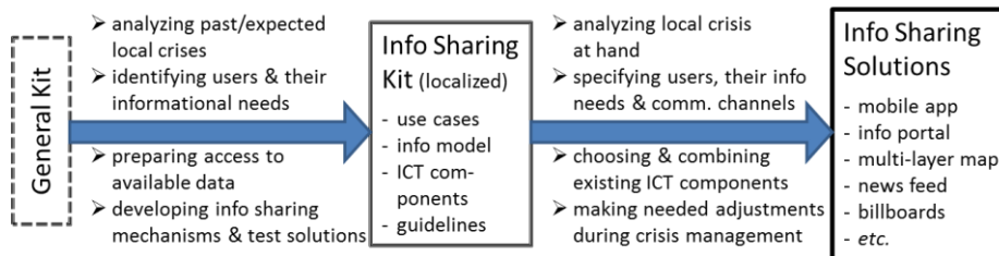
Fig. 2. Transformation of the information sharing kit into ready-to-use solutions

The artifact demonstration aims to involve numerous and diverse members of DMOs trying to use the kit components during a simulation of crisis preparation and management. The artifact evaluation then focuses on the usability of the kit and its effectiveness in terms of creating suitable localized ‘markets’ for crisis-related information sharing. Data collection for evaluation includes observation during simulation as well interviews of participants after simulation.