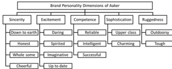
Fig. 1. The personality dimensions which constitute a brand's personality [7, 16].

most commonly associated with a brand. These five personality dimensions [7], [16] viz. Sincerity, Excitement, Competence, Sophistication and Ruggedness can be understood by fifteen distinct dimensions (Fig. 1).