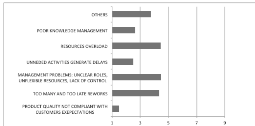
Figure 2. Problems in Product Development: the Italian Sample.

The main product development criticalities encountered in the Italian sample are in terms of management problems , happening when in the development process the responsibilities are not well defined, as a result, the process is chaotic; the projects are very complex to be adequately managed and designers get lost in their activities; and the development process involves too many signatures and bureaucracy is a norm . Secondly the designers are overloaded and cannot keep up with the overload . Also designers often are asked to do many changes during the design process that frequently result in design reworks . Data are in Figure 2.