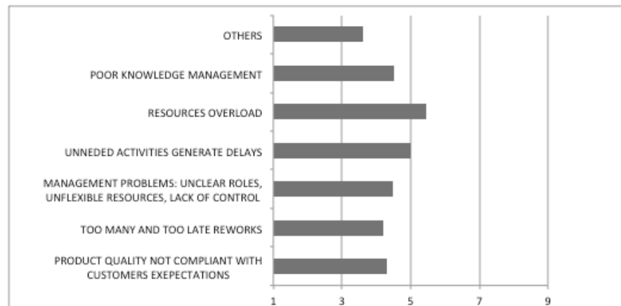
Figure 1. Problems in Product Development: the French Sample.

The main problem affecting the French sample is in term of resources overload , indeed companies declared they find problems when managing projects without exceeding or because using non-planned resources . Secondly, companies sometimes encounter delays problems, since the Time To Market doesn't meet clients expectations, it is too long . Also projects errors/mistakes are reproduced, few lessons learned are undertaken and best practices are not formalized , and once defects are known or chronic, employees are not able to find solutions determine a poor knowledge management . Results on the problems in product development experienced by the French sample are summarized in Figure 1.