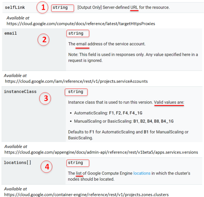
Figure 2. Imprecise string types.