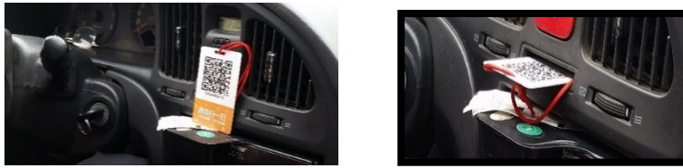
Fig. 2. A WeChat Wallet QR code card (left), tidily tucked away in a card slot when not in use (right), was used by a taxi driver to collect customer's payment.

Without using their hands to handle money, these peddlers could focus on food preparation, which eased their work processes. These sole proprietors and their customers had saved a lot of effort and time by conducting their exchanges in more efficient ways.