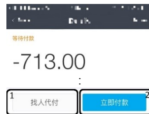
Fig. 5. "Get Someone to Pay" feature on Alipay (1. Get Someone to Pay; 2. Pay Instantly)

In this context, the Get Someone to Pay feature met “gift money” needs by allowing buyers to direct the payment to a third person, altering the flow of money so as to symbolize a form of cultural expression in gifting practices.