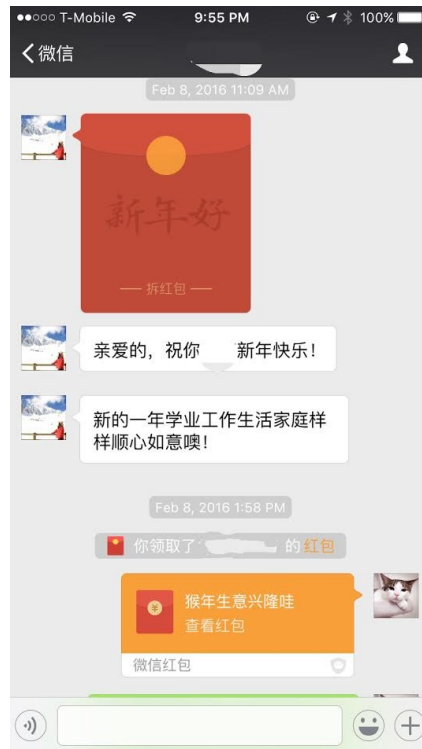
Fig. 3. A Happy Chinese New Year Hongbao in the WeChat conversation.

Both Alipay and WeChat Wallet digitized hongbao within their payment apps (see Fig. 3), thus bringing the use of “ceremonial money” to online and digital spaces.