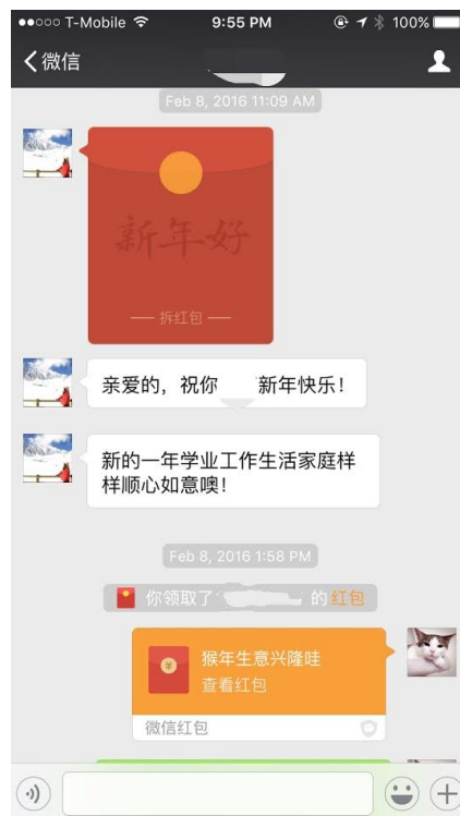
Fig. 3. A Happy Chinese New Year Hongbao in the WeChat conversation.

Both Alipay and WeChat Wallet digitized hongbao within their payment apps (see Fig. 3), thus bringing the use of “ceremonial money” to online and digital spaces.