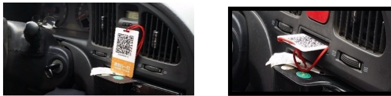
Fig. 2. A WeChat Wallet QR code card (left), tidily tucked away in a card slot when not in use (right), was used by a taxi driver to collect customer's payment.

Without using their hands to handle money, these peddlers could focus on food preparation, which eased their work processes. These sole proprietors and their customers had saved a lot of effort and time by conducting their exchanges in more efficient ways.