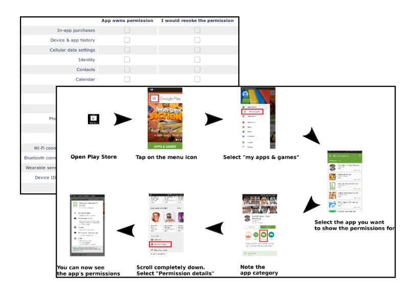
Fig. 1. Step-by-step instructions for permission retrieval given to the subjects (lower right) and one of the ten questionnaire pages for capturing the app permissions and settings preference (allow/reject) in the upper left.