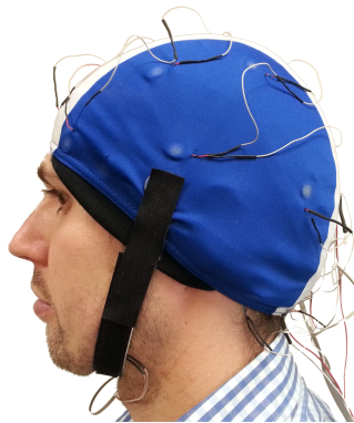
Fig. 1: HapticHead prototype, to be combined with an HMD.

A total of 20 participants (6 female, mean age 24.1, SD 2.5 years) were invited and split up in equally sized experiment and control groups. 11 participants had