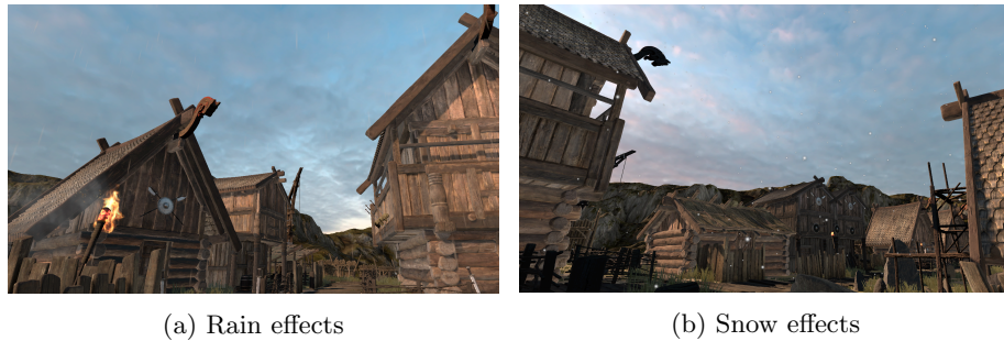
Fig. 3: Enhanced Viking Village VR scene with different weather effects.

Viking Village In the viking village simulation (VV) we took one of Unity's standard environments called "Viking Village" from the Unity asset store and enhanced it with visual, auditory, and vibrotactile rain and snow effects.