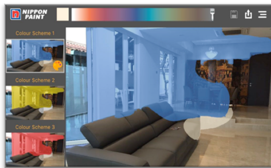
Fig. 2 Screen shot first design

The first coloring app developed in this project enabled users to use different color schemes to color the walls by using finger tapping and selecting a color using the color bar. Deleting the color could be accomplished by dragging from an unfilled space into the colored area. Functions, such as saving projects for later re-use or for sharing with friends, as well as identifying paint store locations on a map were included in the app. Figure 2 shows the application's original design: the small size of the phone screen caused the color to spill over requiring several corrective touches.