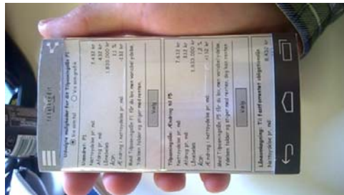
Fig. 2. The wooden smartphone prototype designed to test paper prototypes.

UX evaluations (activities 9 ,10, 11). As a way to show the team which kind of results you can get from an UX evaluation, we conducted both expert evaluations (UX Heuristic Inspection [17]) with HCI experts, and user evaluations (AttrakDiff [22]) with potential end-users. The evaluations were conducted in a lab and were videotaped for the development team to see how the evaluations were conducted, how the test moderator controlled the evaluations, and to hear participants' comments. To show the diversity of UX evaluation methods, we evaluated both a paper prototype and a functional prototype on a smartphone. The prototypes were a result of the previous workshops conducted in the development team (e.g. activity 5) and were modeled to fit the size of a smartphone. This was to explore how and what one can gain from evaluating UX of different stage of development. Since the company was making a prototype which should function on a smartphone, we designed a wooden smartphone-mockup to make the evaluation of the paper prototype more realistic (Figure 2). This made it possible to evaluate the actual screen size elements, to use the swipe function, and to change between different screenshots.