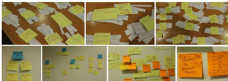
Fig. 1. Affinity Diagramming

To illustrate with an example: We clustered notes with observations such as how users used Talkback at low volumes, or at very fast rates, or strategies such as touching additional ‘fake’ characters while entering passwords to confuse eavesdroppers. These observations led us to arrive at models such as ‘Obscurity is used as a means to achieve privacy’. Such models after subsequent structuring, also developed into a primary category – ‘Assistive software is used as a layer of security’, which we discuss later in section 4.3. In this way most of the categories and chits on the table were analyzed till we arrived at the most novel or relevant themes, in the views of the researchers, as described in the following sections. Fig. 1 showcases the affinity diagramming.