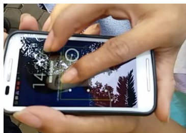
Fig. 4. User using a Pattern lock accurately identifying the dots

Existing studies [47–49] are inconclusive about preferences of Patterns over PINS. Patterns seem to have a higher rate of errors. Yet users tend to prefer Patterns