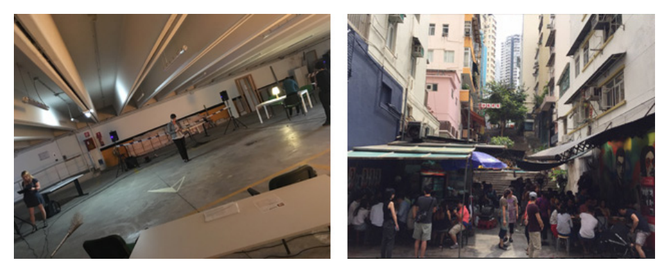
Fig. 1: Installation Environment in Trento, Italy and Real Environment, Hong Kong

part of the COOP2016 conference in Trento, Italy (Fig. 1). Its material components were a circular array of six audio monitors on stands, a north arrow marked on the floor in the center and a bamboo street-sweeping broom. Several chairs and tables were located to the sides supporting computer, audio equipment, and a coffee machine. The car park was accessible by stairs leading down from a small courtyard at the conference venue. The real environments portrayed in the soundscape were pedestrian stairs in Hong Kong that ascend relatively steep inclines in the city and are capped at each end by auto traffic. These are public spaces interspersed with small parks, public toilets and lined with trees, local small businesses and outdoor restaurants. The social and cultural activity of the stairs are the focus of the research project "Hong Kong Stair Archive: Documenting the Walkable City" [8] that grounded initial investigations into the stairs soundscapes.