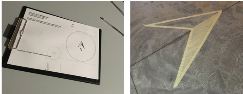
Fig. 2: EP Mapping Form and North Marker on Floor

Participants were asked to “Describe (in any language) some of the sounds that you hear. Number them 1,2,3... and mark their position on the map.” Additionally they were asked to “Describe the ambience that this installation presents.” and after, to “Describe your experience, impressions, or comment on this installation.” Resulting evaluations were written in English, Italian, German, and one in Danish. Participation was largely individual with little discussion or collaboration during the mapping exercise. Several participants sat in one of the chairs to write in more detail, though most remained standing. Instructions were left deliberately simple, and participants took various approaches to completing the exercise.