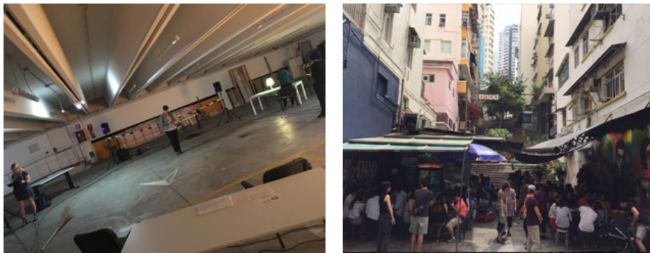
Fig. 1: Installation Environment in Trento, Italy and Real Environment, Hong Kong

part of the COOP2016 conference in Trento, Italy (Fig. 1). Its material components were a circular array of six audio monitors on stands, a north arrow marked on the floor in the center and a bamboo street-sweeping broom. Several chairs and tables were located to the sides supporting computer, audio equipment, and a coffee machine. The car park was accessible by stairs leading down from a small courtyard at the conference venue. The real environments portrayed in the soundscape were pedestrian stairs in Hong Kong that ascend relatively steep inclines in the city and are capped at each end by auto traffic. These are public spaces interspersed with small parks, public toilets and lined with trees, local small businesses and outdoor restaurants. The social and cultural activity of the stairs are the focus of the research project “Hong Kong Stair Archive: Documenting the Walkable City” [8] that grounded initial investigations into the stairs soundscapes.