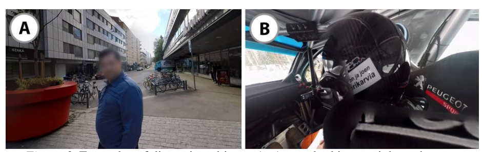
Figure 3. Examples of disrupting objects. A: A man looking straight at the camera as he is passing by. B: The navigator's seat in the rally simulator.

Another example is the rally simulator, as the space inside the car was very cramped, and offered limited options for attaching the camera. Moreover, rules and regulations applied for filming inside rally cars, for instance, the camera was not allowed to reach into the front seat area, and had to remain further back. To get a good view of the windshield and the road ahead, however, we put the camera roughly between the two front seats (Figure 2B). While the primary goal was reached with a good view of the cockpit and the road, the front seats ended up being somewhat disturbing as they seemed to be unnaturally close to the viewport when users were looking around in the car with a HMD (Figure 3B).