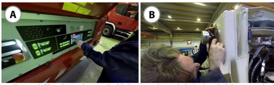
Figure 4. Situations where embedded content is needed. A: A technician operating a large control panel. B: A technician adjusting a small part of a crane, blocking the view with his hands.

Some low-level details and procedures are difficult to present with ODVs. For example, in industrial context, we aimed to record ODVs of maintenance procedures, to be used as reference material and documentation for future maintenance technicians. We found that capturing the fine details of the procedure, such as interacting with a complicated control panel in a correct way, was problematic. Primarily, it was difficult to place the camera close enough to show that much detail properly (Figure 4A). Moreover, the technician conducting the procedure would often obstruct the object from the camera (Figure 4B). In these situations, the role of embedded content, such as pictures, text, and 2D video, is emphasized, to better visualize the details. It is also worthwhile to note that with embedded content (hotspots), one can better guide the user's attention to meaningful objects and events, without the need to rely on the user to always know what to focus on. While Argyriou et al. [1] argued that the UI should be subtle and nonintrusive, in some cases, more disruptive elements could be utilized if it is important to direct the user's attention towards certain elements which she might not otherwise notice. This would be the case in scenarios with a more focused narrative, such as the aforementioned maintenance procedures.