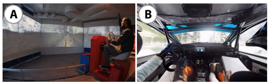
Figure 2. Simulators using ODV content. A: A road grader simulator where the video is projected on the wall using three projectors. B: Rally car simulator used with a VR headset.

ways compared to the industry demos presented earlier. In the road grader simulator, the presentation of iODV content is changed based on user interaction, by rotation, or by adding effects to the video to simulate faster speed. In the rally simulator, the interactivity is limited to starting the rally session, as it is more concentrated on immersion and the experience of rally driving, which most people have no other chance of experiencing. In the next version, we will provide the user with more interactive content such as information on the route driven.