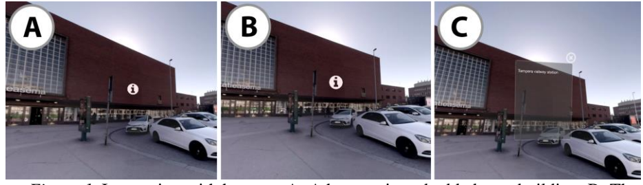
Figure 1. Interaction with hotpots. A: A hotspot is embedded on a building. B: The user focuses the hotspot at the center of the viewport, and the hotspot starts growing to visualize dwell time. C: The hotspot is triggered, and the content is shown.

In this section, we present iODV applications based on which we present our guidelines later in this paper. The use cases vary from entertainment to navigation and industrial use, and were carried out in collaboration with several large industrial companies and cultural institutions.