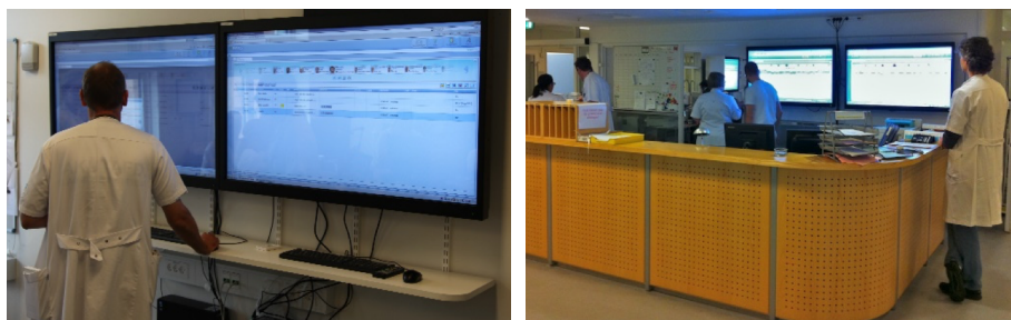
Fig. 1. The electronic whiteboard (a pair of 52-inch touch screens) in two of the EDs.

It is important to note that the whiteboard has been successful in supporting the ED clinicians in forming and maintaining an overview of their work. In interviews