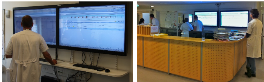
Fig. 1. The electronic whiteboard (a pair of 52-inch touch screens) in two of the EDs.

It is important to note that the whiteboard has been successful in supporting the ED clinicians in forming and maintaining an overview of their work. In interviews