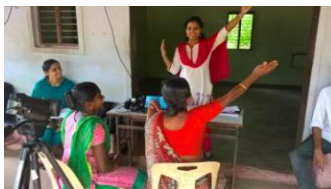
Photo 2: Paper prototype