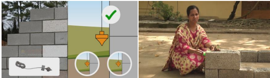
Snapshot 1&2: Comparing the initial Version and final version of Plumbob video

emphasize the concept to the user. A correct response was appreciated by the animation character by gestures to motivate and increase the engagement of the user.