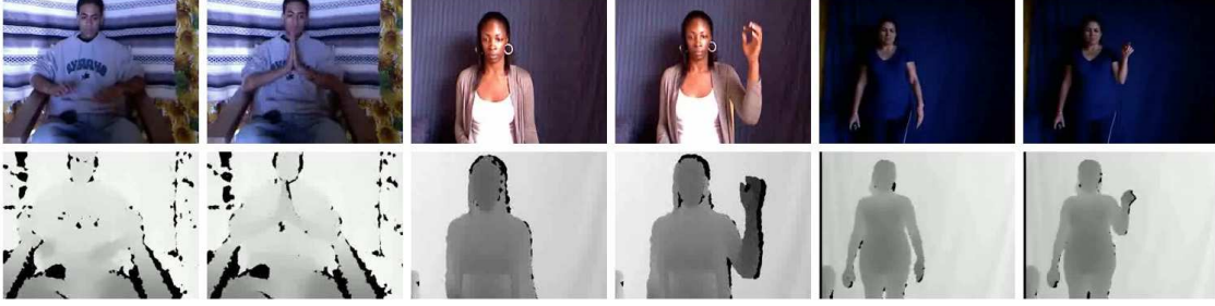
Figure 1. Examples of gestures from the IsoGD and ConGD.

sets, please refer to [7]. Some examples are presented in Figure 1.