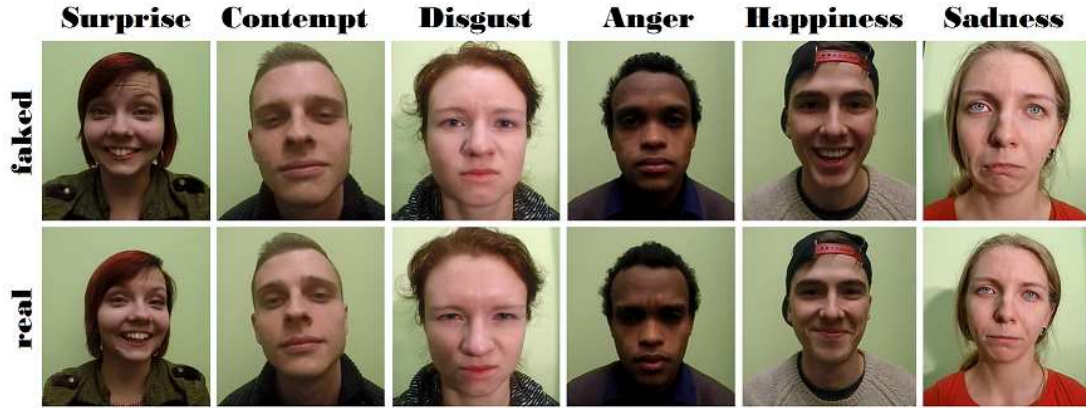
Figure 3. Examples of faked and real expression from third challenge track.