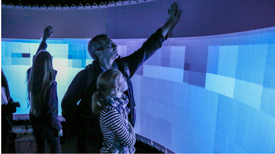
Fig. 3. Exploration and co-learning within the installation. September 2014, ‘Clocks and Clouds’.

a curiosity about perception of temporal, spatial, and sonic density and the way spatial and temporal textures depend on establishing in the visitors an understanding of the generative principles and the importance of group interaction. The stark and abstract quality of the piece poses a challenge to perception. It serves as an investigation into how our perception is capable of separating visual and acoustic streams and how sensory overloading has the effect of forming clusters, fused objects, or gestalts [24] that consciously emerge through the abstract phenomena perceived. The central topic of interest is social interaction between several visitors, in particular in relation to the reduced sonic and graphical elements, and the richness of the spatial envelopment arising from several people interacting at the same time. The development process of the piece was typical of working in this environment. Through a series of iterations, the original sketch slowly gained in complexity, up to the point where adding more elements, intricate state- or behaviour-mechanisms became counter-productive. Evaluating the effectiveness of engagement and interaction and judging when to stop adding complications was only possible in situations where a number of visitors entered into unguided play with the piece.