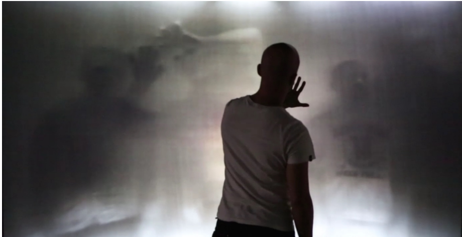
Fig. 1. Interaction in the ‘Immersive Lab’. July 2015: Haunted ‘Mirror’.

The IL platform we are developing since 2010 is a vehicle for the exploration of spatial media-arts work, combining the modalities of musical and visual surround presentation with a full-scale interaction surface. Central in the installation is the perceptual fusion of the three sensory modalities of vision, audition, and touch, thus providing a seamless interactive experience. It is sufficient to say about the design and constructing the installation itself that the dimensions and arrangement of the elements was guided by the intention to provide a human-sized space which fosters multi-sensory, embodied engagement (see Fig. 1).