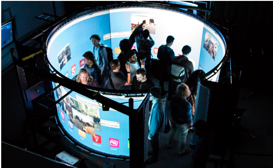
Fig. 4. Large Group interaction inside the ‘Immersive Lab’. November 2015 at the Gray Area Foundation for the Arts, San Francisco, CA.

standing of how synchronisation, coordination, and competition function within the interactive situations. These effects can only be seen and understood in the full installation scenario with an adequate number of visitors. Furthermore, the scale and scope of immersion is difficult to anticipate. The understanding about mechanisms and effect of interaction models on this dimension of experience can only be achieved through exposure to the actual setting. All this to emphasise the absolute necessity to experiment in the actual setting and adapt the original concept and idea to experienced and observed behaviours and interaction patterns.