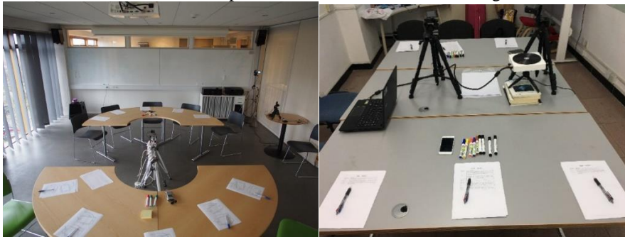
Fig. 1. Meeting room. Groups are placed at crescent tables, GoPro cameras record interactions in both groups. Secondary cameras record interactions and discussions between groups. Left side= Focus group in Denmark, Right side=Focus group in China.

For participants in both FGs, it was first stressed that their participation did not constitute an evaluation of their academic performance. Each focus group comprised five progressive phases that lasted 2.5 hours including a short break. These five phases were: a warm-up phase, a brainstorming phase, a pros & cons phase, a design phase and a validation phase. Transcripts from data gathered in the five phases were then divided into four main sections: Warm-up, Brain Storm, Pros & Cons, Design and Validation.