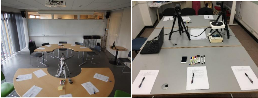
Fig. 1. Meeting room. Groups are placed at crescent tables, GoPro cameras record interactions in both groups. Secondary cameras record interactions and discussions between groups. Left side= Focus group in Denmark, Right side=Focus group in China.

For participants in both FGs, it was first stressed that their participation did not constitute an evaluation of their academic performance. Each focus group comprised five progressive phases that lasted 2.5 hours including a short break. These five phases were: a warm-up phase, a brainstorming phase, a pros & cons phase, a design phase and a validation phase. Transcripts from data gathered in the five phases were then divided into four main sections: Warm-up, Brain Storm, Pros & Cons, Design and Validation.