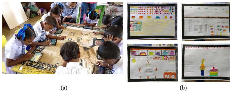
Fig. 1. (a)The children playing the mobile games for the first time and explain their thoughts, (b) some of the drawing artefacts from the children illustrating their favourite scenarios of the games

have played a mobile game before (Fig.1-a). While this was done as an ice breaker, we did not hesitate to try and learn children's perspectives about the games they were playing. We used this to see which interactions are intuitive and which are not. The children were informed that they can ask for help if necessary. We were particularly mindful not to ask any "Leading" questions. Since the game was in English, none of the students could understand the instructions given and they had difficulties in understanding some of the icons used. We realized that the children were just trialing and learning. This was evident in one of the game plays which involved a bakery. The player can bake a cake and sell it. Nevertheless, the children kept on baking cakes even though they have made one cake. They confided that they thought the game was about making a cake instead of a shopping game. All the games highlighted every element that needs to be clicked in a hierarchy. The children seemed eager to click/touch on anything blinking or anything with bright colours. Hence, most of the children were able to get by playing the game, even though they didn't understand the spoken language. While we perceive this as to be an effective mechanism to make interactions intuitive to novice users we also observed that the children who took the time to learn how to play, showed signs of frustration though out the session even though they had learned.