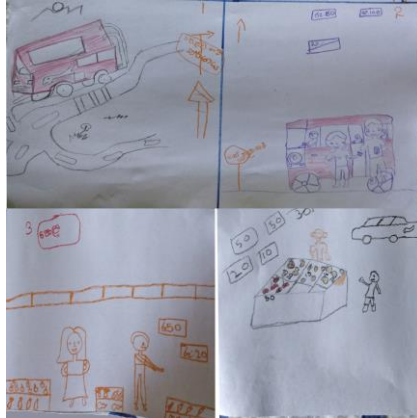
Fig. 3. The story of going to the market by bus. This was a detailed drawing illustrating going to the bus stop, waiting till a CTB bus arrive, going to the market, buying goods and return by a taxi.

The other common theme was transportation, either by bus or by train. Here the children drew scenarios where they would travel either to school or visit family. It was fascinating to see how extremely detailed some of the drawings were. For instance, one drawing illustrated the bus stops and explicitly mentioned the way to the market. An interesting observation was the colour of the bus. In all the drawings, the bus was coloured in red. The red colour busses are the Sri Lanka transport board (CLTB/CTB) bus and they offer a discounted price for school children and they implement season tickets at a subsidiary rate. The children stated that they would always wait for a CTB bus. One team has decided that they want to draw a complete story which represents the scenarios where they would interact with money. Here, the characters would take a bus to the market, buy items and return home from a taxi or a three-wheeler (tuk-tuk). There were numbering the screens, using arrows and even writing instruction as next scene as a means of the guiding the teacher to follow their story since the teacher was not there and the signs would help her construct the story.