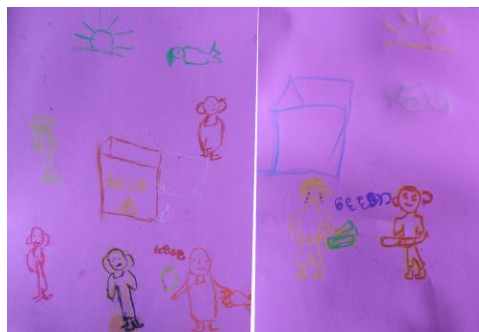
Fig. 4. The drawing of the debt payment scenario. The left-hand board shows a scenario of taking on a debt from the village butcher while the right side board shows the payment of debt.

The other common theme was transportation, either by bus or by train. Here the children drew scenarios where they would travel either to school or visit family. It was fascinating to see how extremely detailed some of the drawings were. For instance, one drawing illustrated the bus stops and explicitly mentioned the way to the market. An interesting observation was the colour of the bus. In all the drawings, the bus was coloured in red. The red colour busses are the Sri Lanka transport board (CLTB/CTB) bus and they offer a discounted price for school children and they implement season tickets at a subsidiary rate. The children stated that they would always wait for a CTB bus. One team has decided that they want to draw a complete story which represents the scenarios where they would interact with money. Here, the characters would take a bus to the market, buy items and return home from a taxi or a three-wheeler (tuk-tuk). There were numbering the screens, using arrows and even writing instruction as next scene as a means of the guiding the teacher to follow their story since the teacher was not there and the signs would help her construct the story.