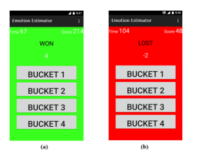
Fig. 2. The Emotion Estimator game interface with two possible situations. (a) is an example screenshot when a player guess right bucket, and hence, wins; (b) is an example screenshot when a player guess wrong bucket, and hence, loses.

scribed below. A player tries to guess in which bucket the ball is. Each wrong guess attracts a penalty of 2 and each correct guess gains an increment in score by 4. Time is displayed at the top left corner of the screen and total score is displayed at the top right corner of the screen. The duration of the game is 2 minutes (120 seconds). Fig 2 shows the game interfaces for two particular instants.