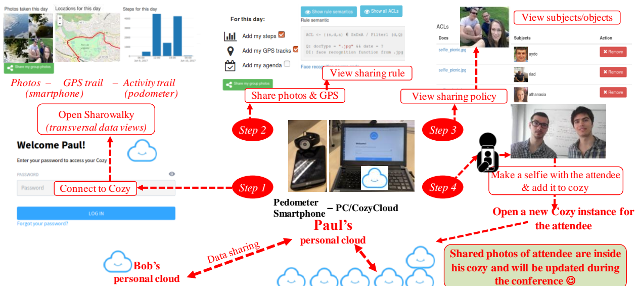
Fig. 3. Demonstration scenario. Video available at http://wanda.inria.fr/demos/videos/swyswyk_model.avi