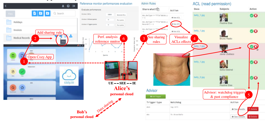
Fig. 2. Demonstration scenario and GUI.

The second part of the demonstration (Fig. 3, steps 1-4 and step 5) focuses on the security properties and shows what is happening 'under the hood' at rule creation and execution time. The attendees play the attacker role and add a malicious rule hurting Alice privacy. The GUI shows what is running in Cozy (UE), in the Raspberry Pi (IE) and in PlugDB (SEE) inside PlugDB. The attendees can then understand where and when data is decrypted, keys are stored and access decisions are taken.