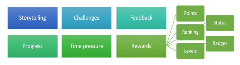
Fig. 2 Serious game mechanism [28]

In the following, with regard to the use case, we will focus on challenges, feedback and progression. Playing a game confronts the player with a certain uncertainty and suspense. The mastering of tasks in increasing levels of difficulty pose a challenge for users. The intrinsic motivation, especially of ambitious players but also of those players with a weak ambition, is affected by cognitive challenges. Feedback, which is bounded to the need for recognition, is another motivating mechanism. Other than challenge, feedback is affecting the extrinsic motivation. It enables the recipient to reflect and contextualize its own work. This way, feedback supports the learning progress and motivates the player at the same time. Progression, too, is supporting the reflection of performance. Progression in serious games can be adapted in different contexts. On the one hand, it may be used in form of a progress bar which shows the achieved but also the forthcoming efforts. On the other hand, it can be applied in form of a curve that illustrates skill improvements and achieved mile stones. This way, gaming mechanisms like feedback and progress impart a feeling of competence and positively affect self-reported learning outcomes [29]. All three components, challenge, progression and feedback, positively affect users motivation and are therefore appropriate mechanics for Serious Game in a corporate context.