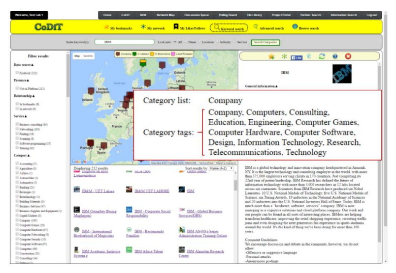
Fig. 3. Illustration of semantics-based business categorization approach

A screenshot of the CoDiT system showing the official Facebook page of IBM company<sup>9</sup> is given in Figure 3. As illustrated, the Facebook platform returns only one category for IBM, i.e. 'Company' (cf. category list in Figure 2)<sup>10</sup> which does not sufficiently help to understand what the given company deals with.