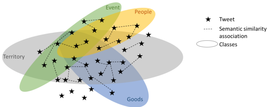
Fig. 2. “Concept-similarity” graph: semantic aggregation of classified tweets.

As a result, for a sliding time window, at all time, a “concept-similarity” graph can be established as illustrated in Fig. 2.