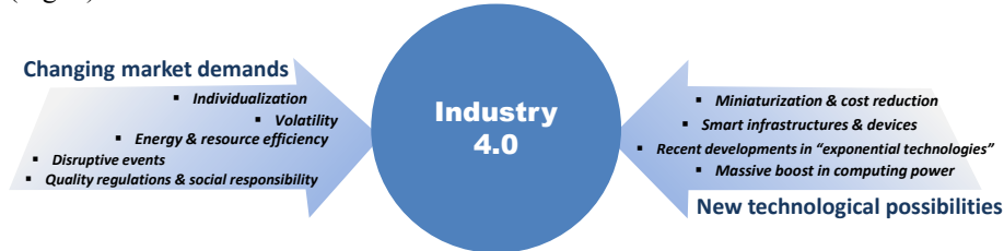
Fig. 1 – Driving forces

This industrial transformation momentum towards industry 4.0 is driven by two major forces – the new technological possibilities, and the fast changing market demands (Fig. 1).