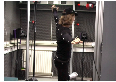
Figure 1. CLOUD system installation.

We used OSC (Open Sound Control) protocol to transmit in real-time the position information from Optitrack to a gesture analysis MaxMSP patch and a gesture synthesis C++/OpenGL program. The graphical feedback has been performed using the OpenGL library and an open source particle generator (SPARK), which provides a realistic rendering of fire, rain or smoke. This particle generator has been adapted to simulate a cloud-like matter by adding cloud transmitters.