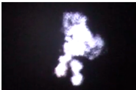
Figure 3. Excited cumulus.

Within the Cloud project, a specific application has been prototyped where a dancer can generate a cloud and interacts with it. The MaxMSP interface receives the markers positions and processes the gesture analysis by computing gesture descriptors related to dance movement characteristics. These descriptors are meant to be mapped to the virtual cloud input parameters. We conceived a gesture control strategy that maps gesture descriptors to specific cloud parameters. For example, the quantity of motion is mapped with the gravity of the cloud.