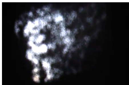
Figure 4. Wind effect (cumulus).