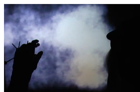
Figure 6. Stratus contemplation.