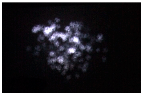
Figure 7. Cloud generation related to the dancer motion.