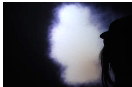
Figure 5. Stratus (without movement).