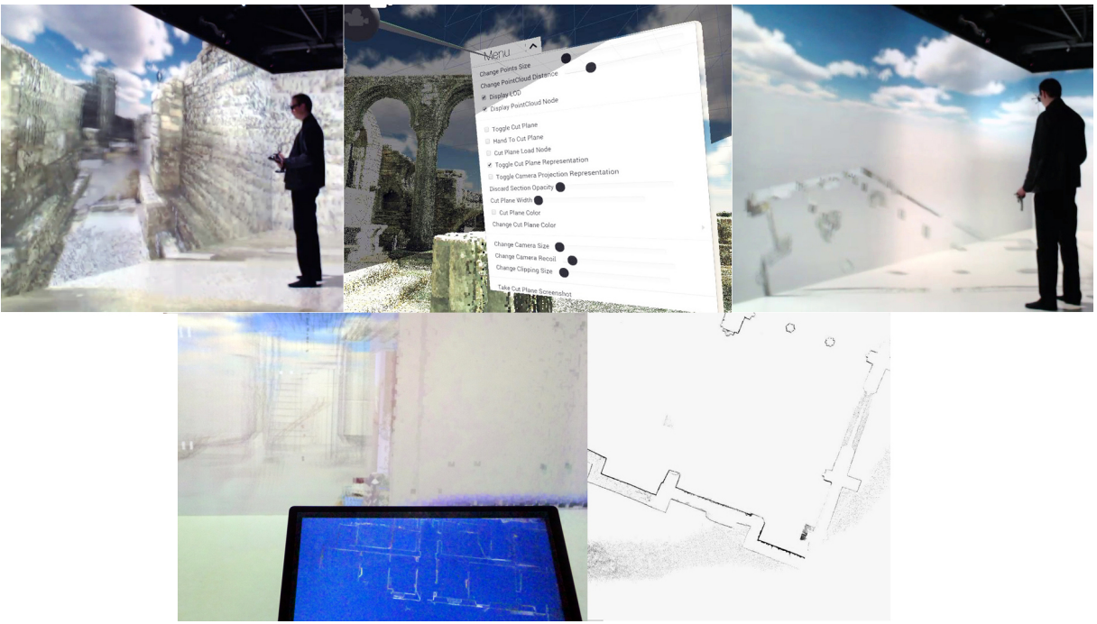
Figure 3: « Cutting plane » creation process by an operator in the Immersia platform.

We now need to have the tool tested by a large community of archaeologists, in particular to check if the use of the Flystick to move the cutting plane is sufficiently precise. At the same time, we still have to improve the optimization of the point clouds management. Concerning the reduction of the I/O time and disk space, it will be necessary to store the points coordinates on 2 bits (instead of 4), to downgrade the precision to the millimetre unit, to decrease the entropy, and to use zstd compression. The use of culling